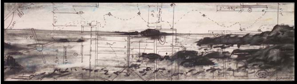
Charlotte Mann (May 2006) Untitled Seascape 19"x6" Mixed-media