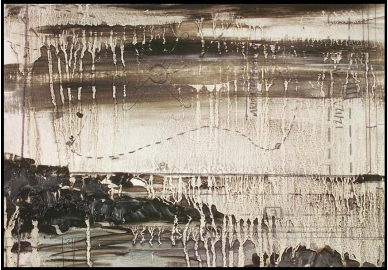
Charlotte Mann (Sept 2006) Untitled Seascape 10"x 6" Oil, graphite