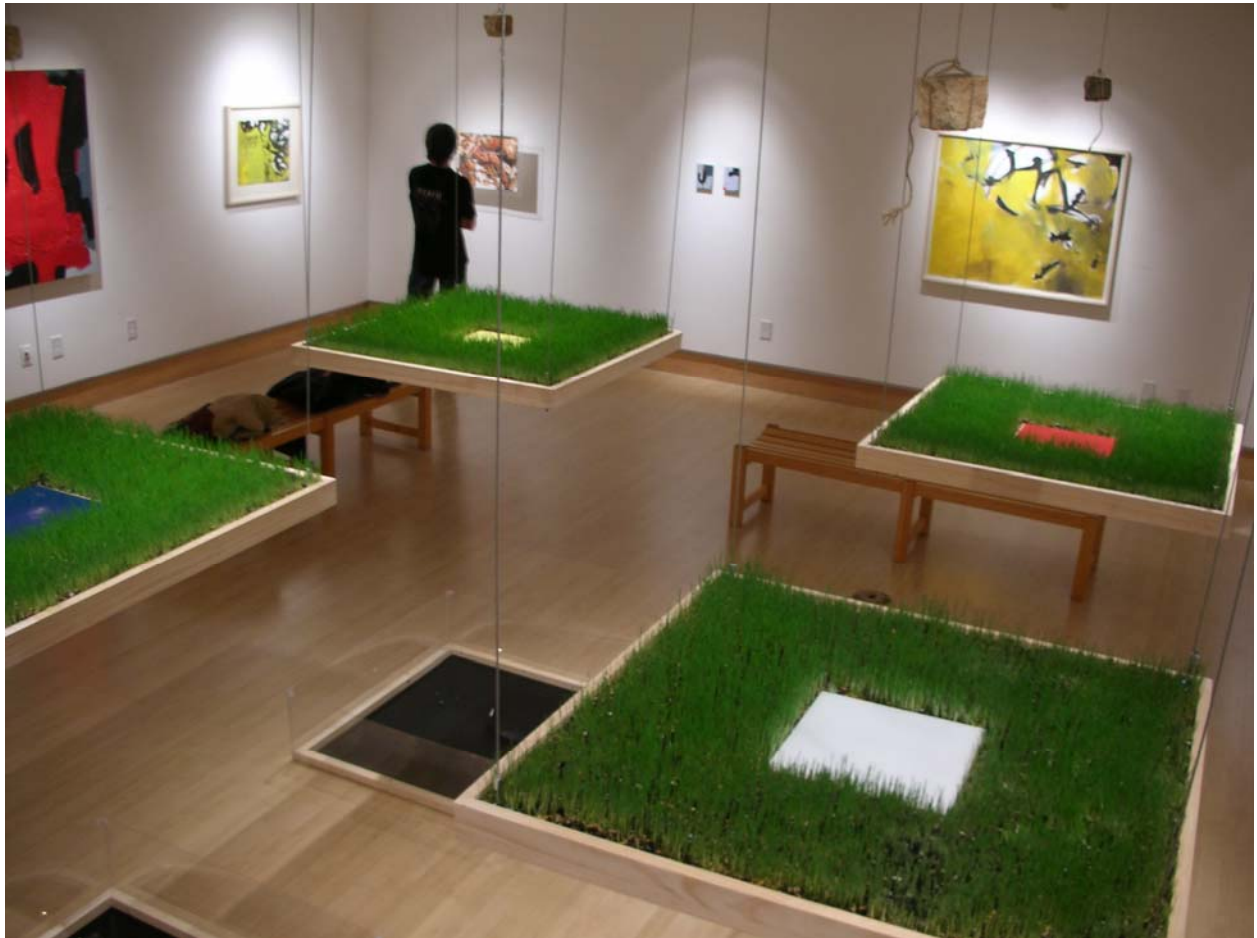
Matthew Banker (2006) Untitled (Suspension) 12'x12'x14' Grass, Wood, Brick, Glass, Steel Cable, Twine