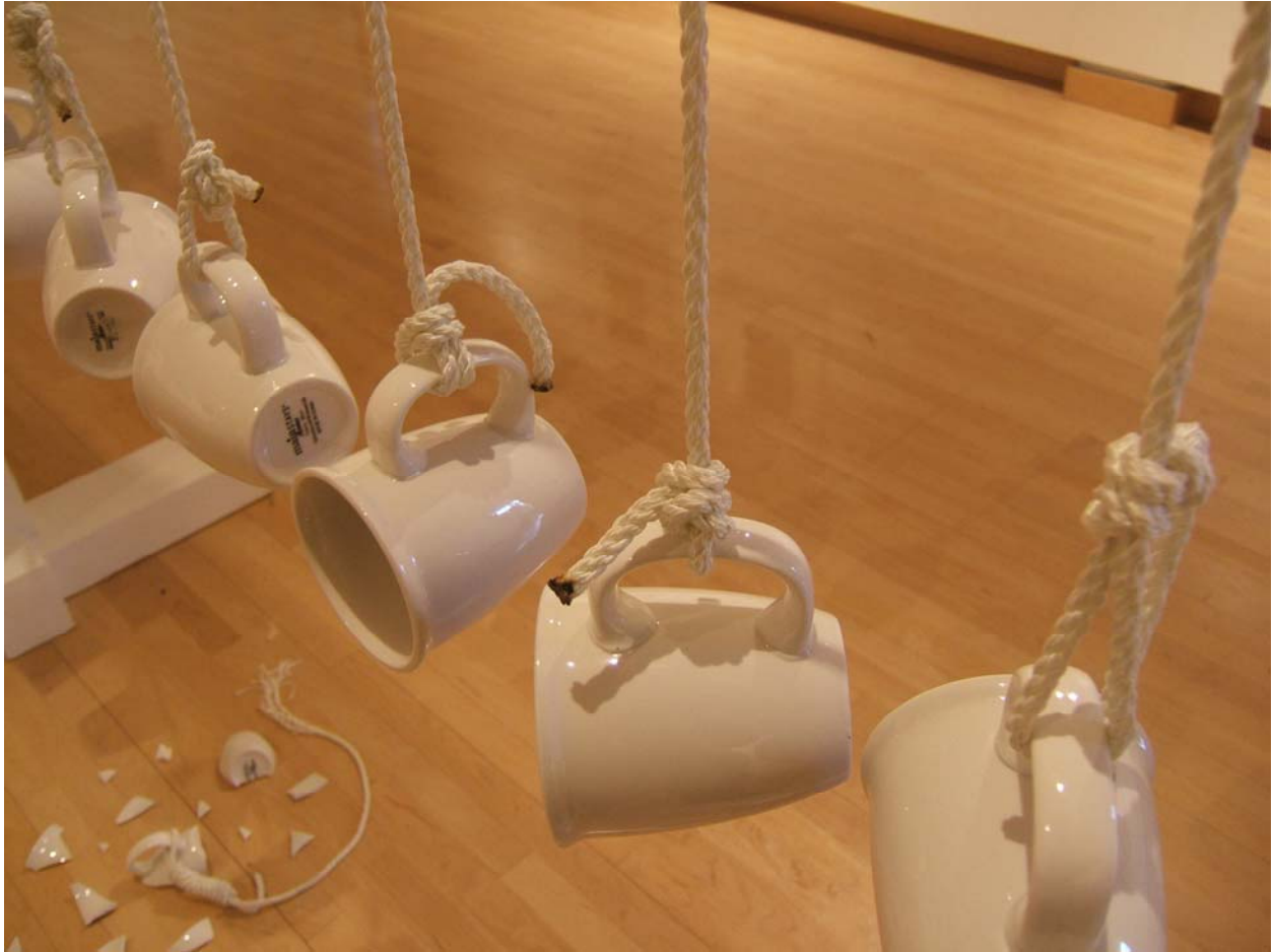
Matthew Banker (2006) Apostle / Apostate 8'x2'x8' Ceramic cups, Wood, Rope