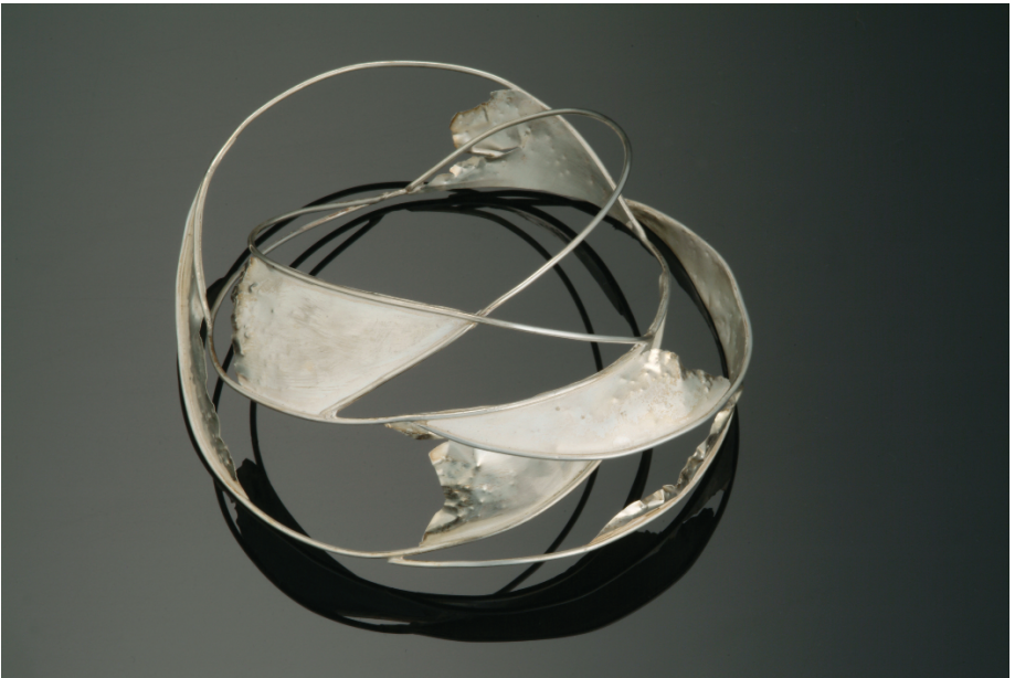
Valerie Kasinkas (2005) Variety Serices Bracelet