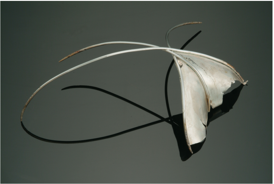
Valerie Kasinkas (2005) Variety Series Brooch